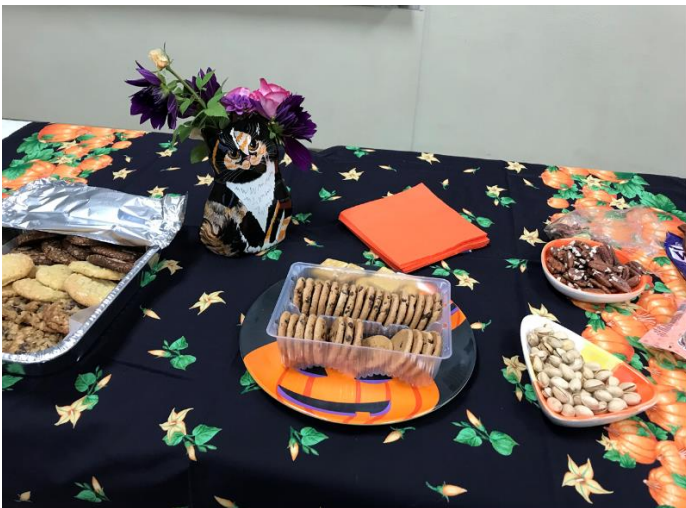
Our break snacks