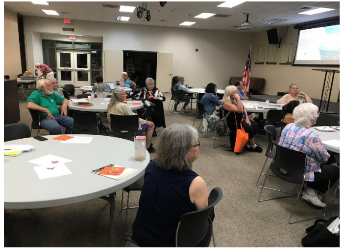
Some of our attending members